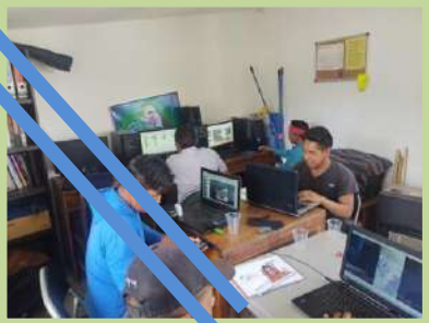
Traditional Career (Cultural Centers)