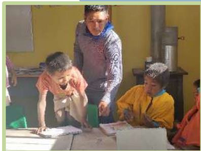
Gavilana Cultural Center